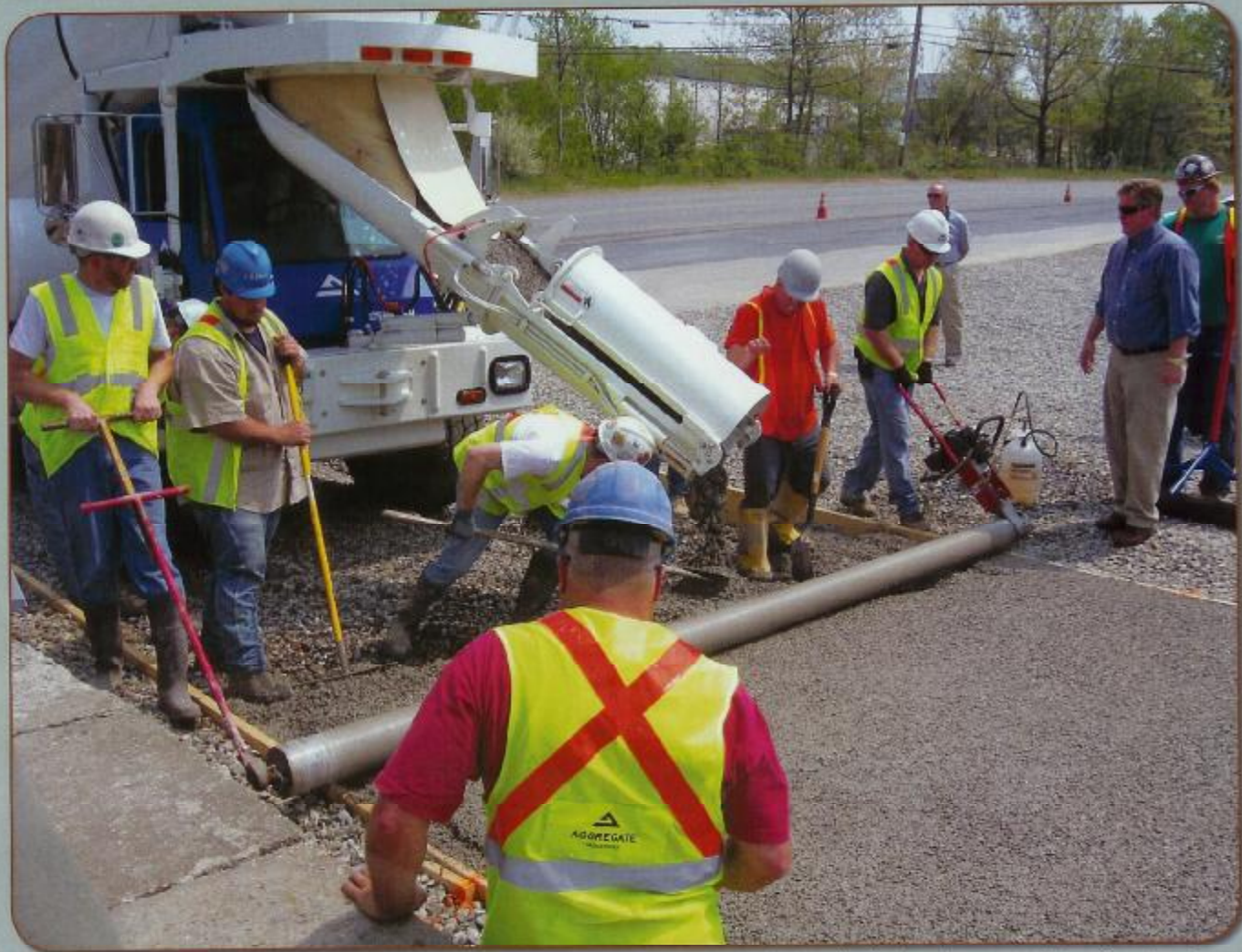
A steel pipe roller levels and compacts high-void ready mix.

A Sutton, Mass., pavement demonstration conducted as part of an industry seminar provided designers, contractors and materials producers with important tips on using pervious concrete, a building material fast gaining recognition for its stormwater management and sustainable characteristics.