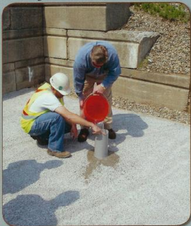
On a previously cured section, Banka demonstrates how rapidly water percolates through pervious concrete.