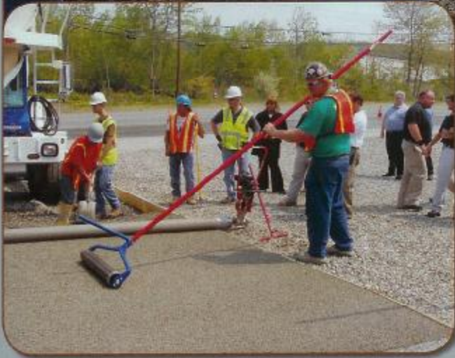
Left: A single pipe roller provides the finishing touches just before crew places plastic sheet over material for curing.