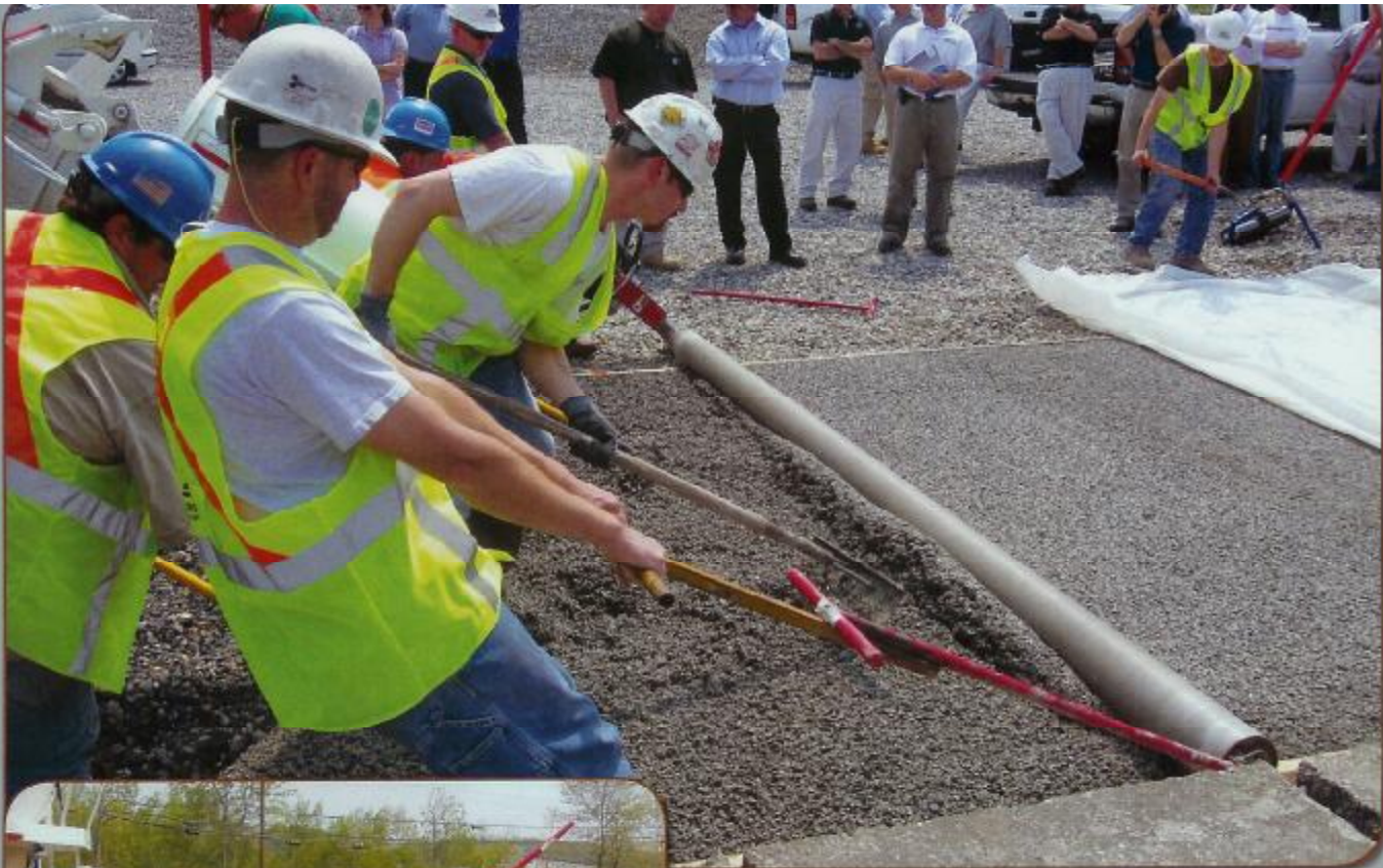
Above: Another view of pipe roller shows its screed action as designers and contractors look on.